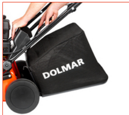
Easy box emptying