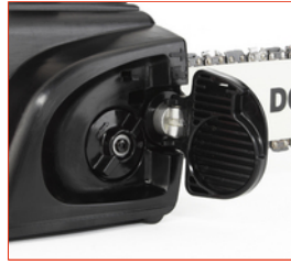
Tool-less chain tensioner (TLC)