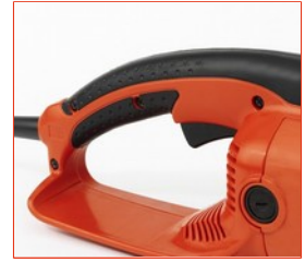
Soft handle and big trigger switch provide safety and comfort