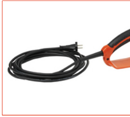
5 m cable as a standard