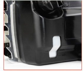
Fill level window