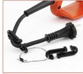
Optimal cable routing with strain relief clamp