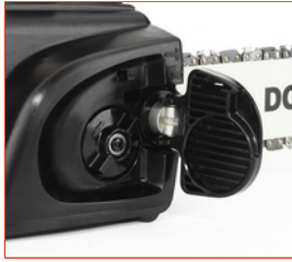
Tool-less chain tensioner (TLC)